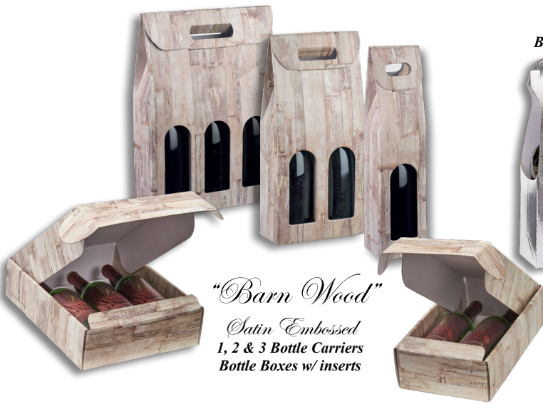
“Barn Wood” Satin Embossed 1, 2 & 3 Bottle Carriers Bottle Boxes w/ inserts