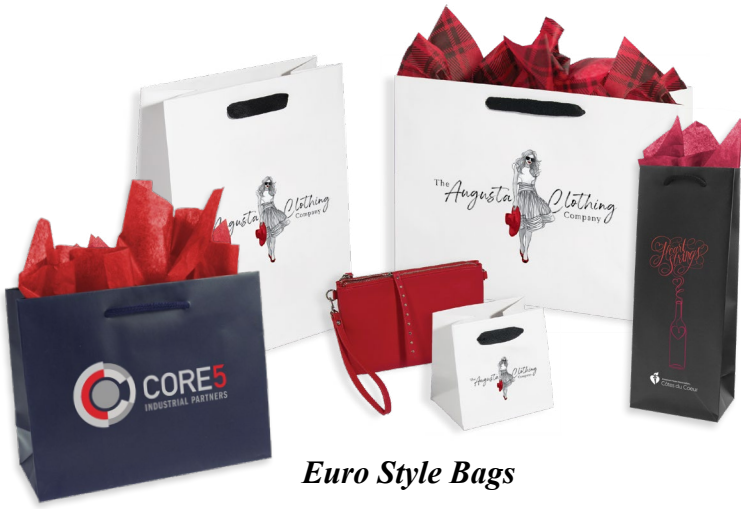
Euro Style Bags