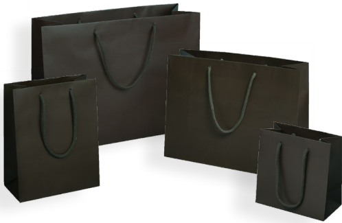
Espresso (ESP) M8, 16, 13 & 6