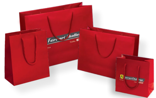
Cherry Red (RED) M8, 16, 13 & 6