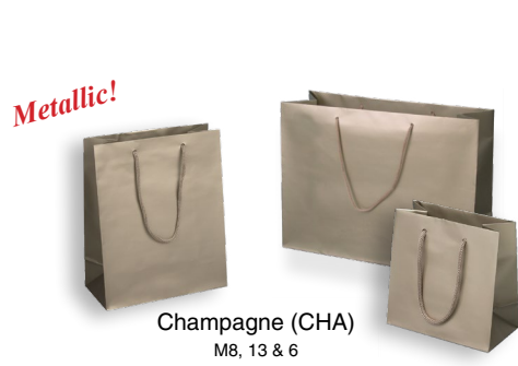
Champagne (CHA) M8, 13 & 6