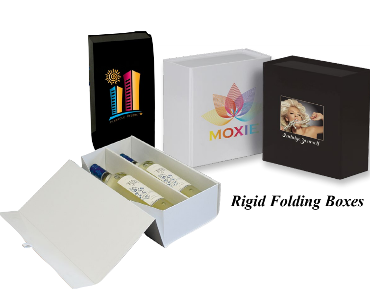
Rigid Folding Boxes