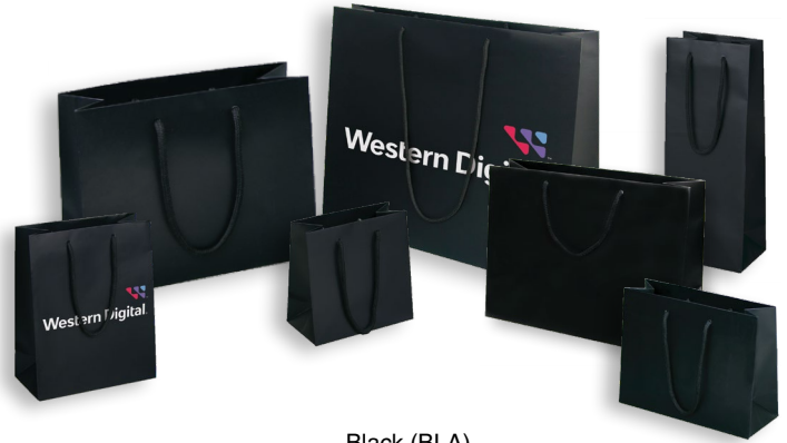
Black (BLA) All Sizes