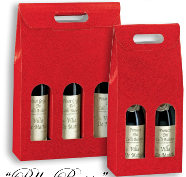
"Pelle Rosso" Red Pebble 2 & 3 Bottle Carriers