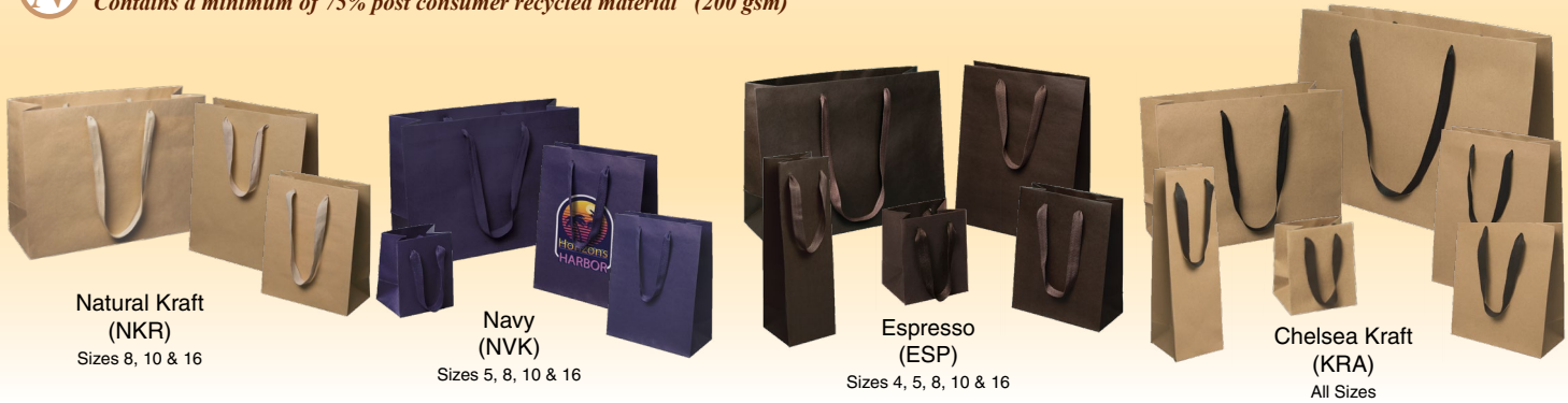
Natural Kraft (NKR) Sizes 8, 10 & 16

N Uncoated with Natural Interior Contains a minimum of 75% post consumer recycled material (200 gsm)