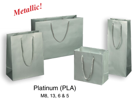
Platinum (PLA) M8, 13, 6 & 5