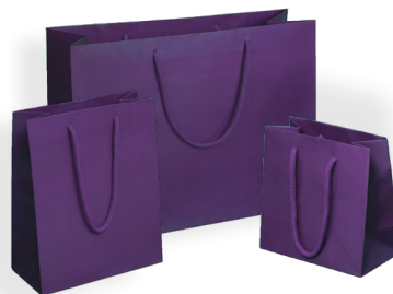
Regal Purple (REG) M8, 16 & 6