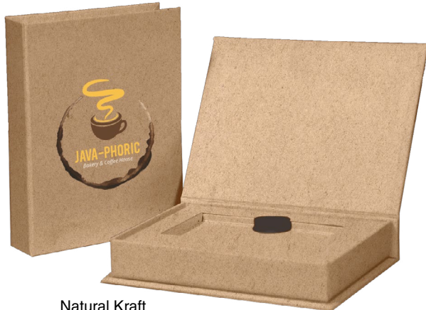
Natural Kraft (KRA)