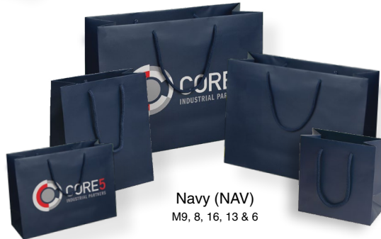
Navy (NAV) M9, 8, 16, 13 & 6