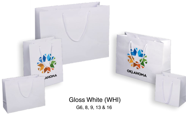
Gloss White (WHI) G6, 8, 9, 13 & 16