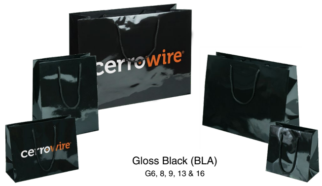
Gloss Black (BLA) G6, 8, 9, 13 & 16