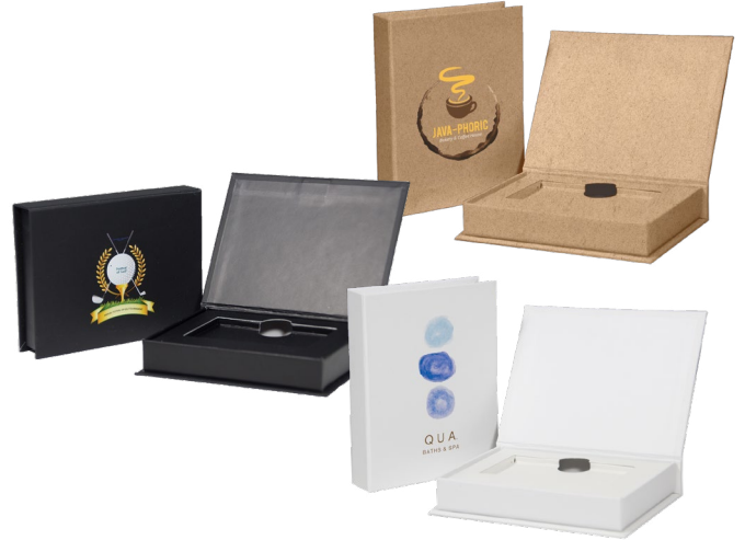
Soft Touch Boxes