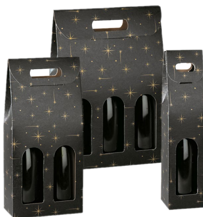
"Constellation" Smooth Finish 1, 2 & 3 Bottle Carriers

(CON) (WHI) (NAV) (NAT) (WOO) (SNO) (ARG) (SBI) (PRO) (ORO) (PMA) (GRI) (NER) (TAW)