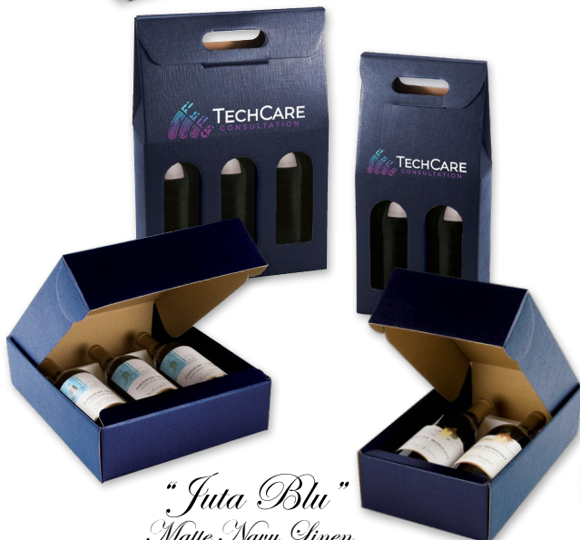
"Juta Blu" Matte Navy Linen Bottle Carriers, and Bottle Boxes w/ inserts E-Commerce Boxes