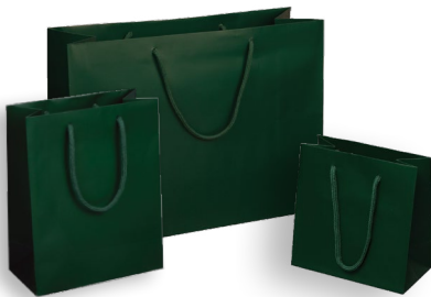
Dark Green (DGR) M8, 16 & 6