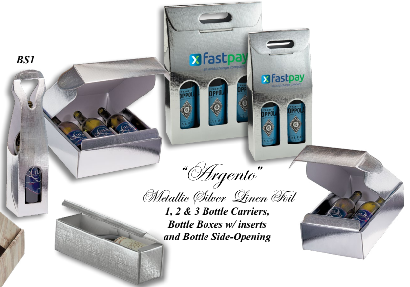
“Argento” Metallic Silver Linen Foil 1, 2 & 3 Bottle Carriers, Bottle Boxes w/ inserts and Bottle Side-Opening