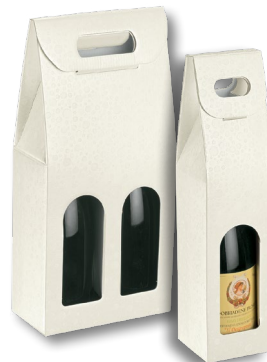
"Sere Bianco" Bubble Texture 1 & 2 Bottle Carriers