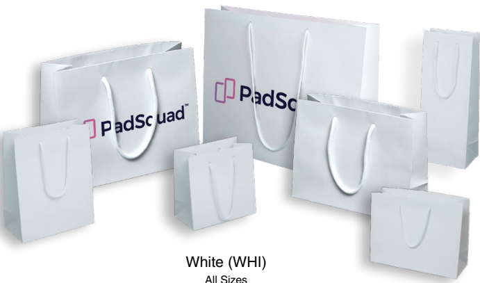
White (WHI) All Sizes