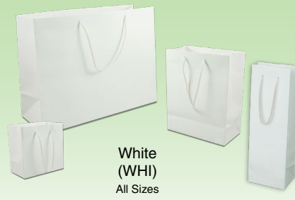
White (WHI) All Sizes

Contains a minimum of 40% post consumer recycled material (180 gsm)