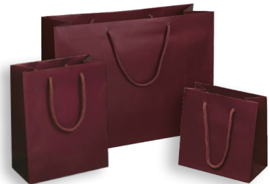
Burgundy (BUR) M8, 16 & 6