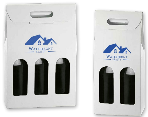
"White Kraft" Smooth Finish 2 & 3 Bottle Carriers