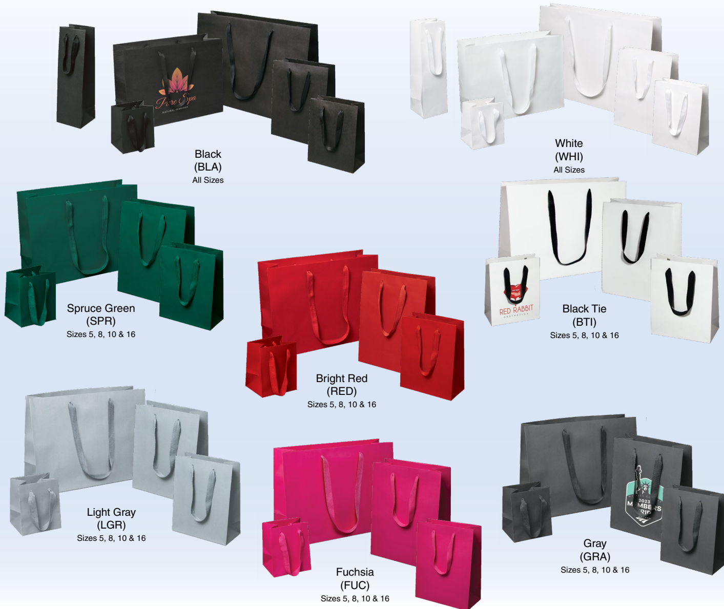
Black (BLA) All Sizes

W Uncoated with White Interior Contains a minimum of 40% post consumer recycled material (180 gsm)