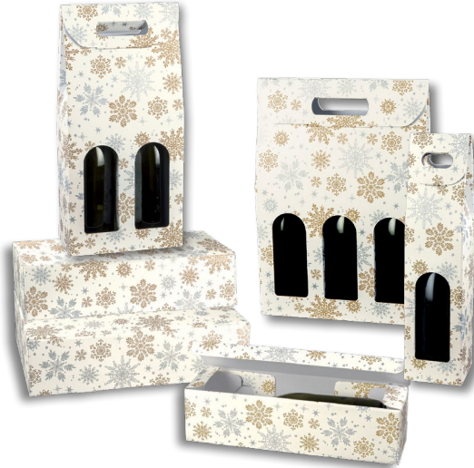
“Alpine Snowflake” Linen Embossed 1, 2 & 3 Bottle Carriers, Boxes, & Bags