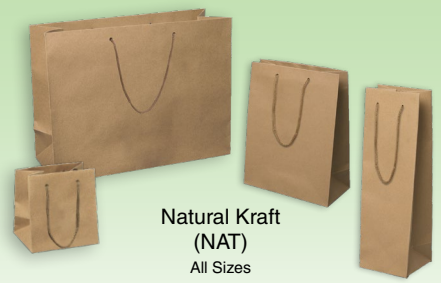
Natural Kraft (NAT) All Sizes

Contains a minimum of 40% post consumer recycled material (180 gsm)