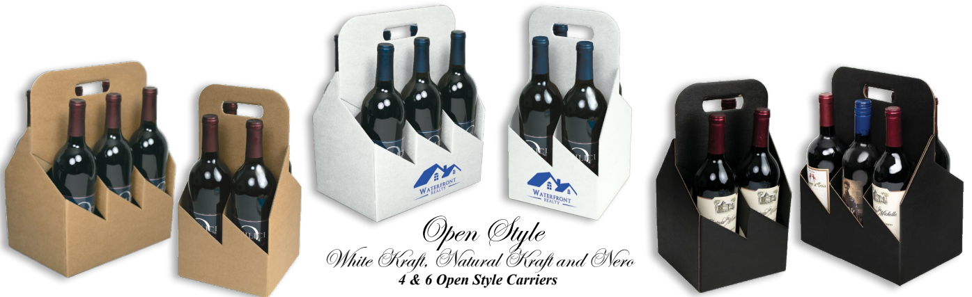
Open Style White Kraft, Natural Kraft and Nero 4 & 6 Open Style Carriers