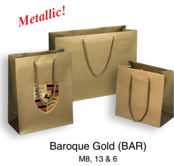
Baroque Gold (BAR) M8, 13 & 6