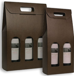
"Pelle Marrone" Chocolate Pebble 2 & 3 Bottle Carriers