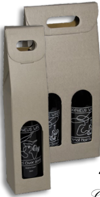
"Grigio" Gray Groove 1, 2 & 3 Bottle Carriers