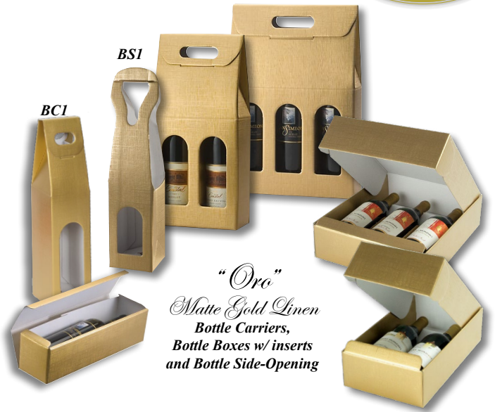
“Oro” Matte Gold Linen Bottle Carriers, Bottle Boxes w/ inserts and Bottle Side-Opening